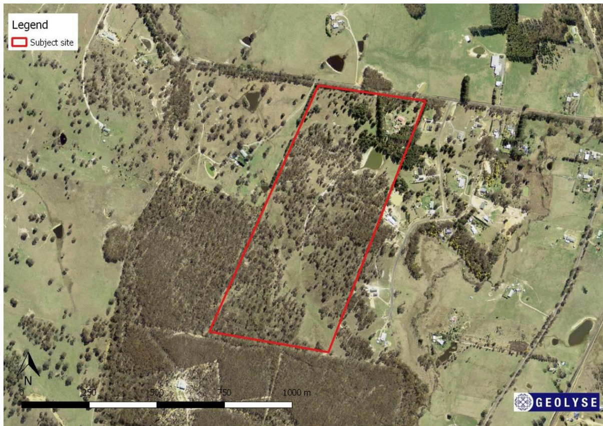
Figure 2: The subject site